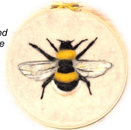
2D Felted Bumble Bee